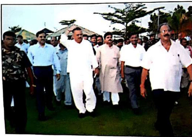
Vidhansabha visited the Mukhtangan. They observed the progressive work of Mukhtangan.

On the 28th July the Chief Minister Dr Raman Singh and Culture minister Brijmohan Agrawal and the members of Chhattisgarh